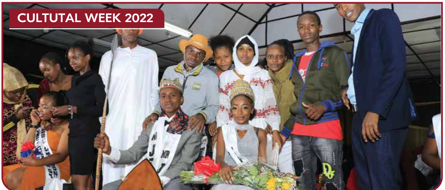
CULTURAL WEEK 2022

Cultural week is quarterly event that happens during the last quarter of the every Year ,It's a long week event that brings students together and consists on a beehive of activities that are competitive ,Eduacative and share of cultural, Religion and traditional experience.