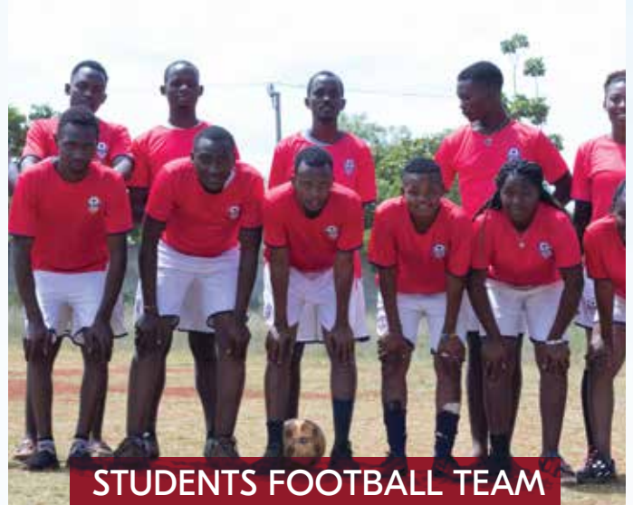
STUDENTS FOOTBALL TEAM