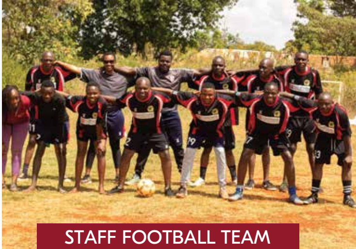
STAFF FOOTBALL TEAM

Sports is a vital program in the growth of a human being. Outdoor and indoor games help in cognitive strengths and as well assist the trainees in understanding and explore their talents at their level best.